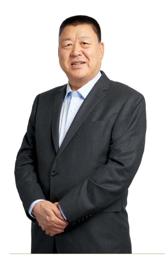
66 我们将继续培育我们在2018年 财政年度所播下的投资种子。 我们将谨慎地管理这个过程,并不断 迎接各种挑战。99